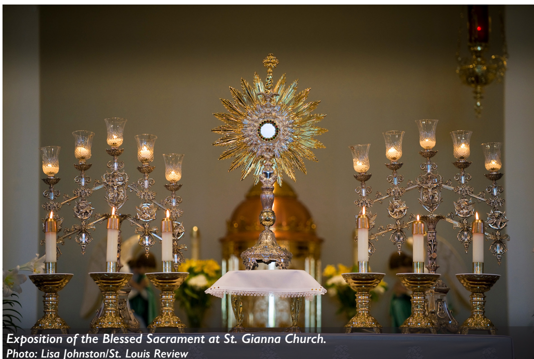
Exposition of the Blessed Sacrament at St. Gianna Church.

Despite the frequency of these conferences near the