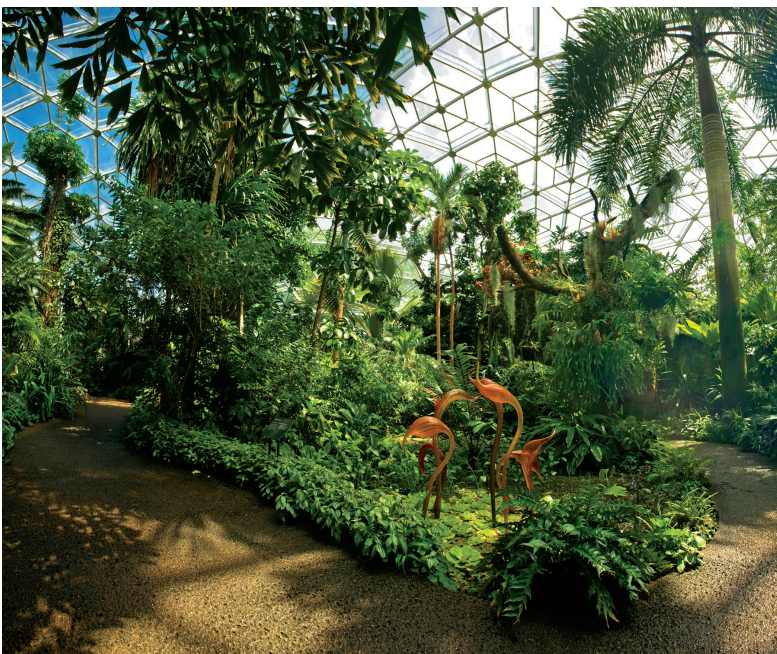
A look inside the Climatron at the Missouri Botanical Garden.