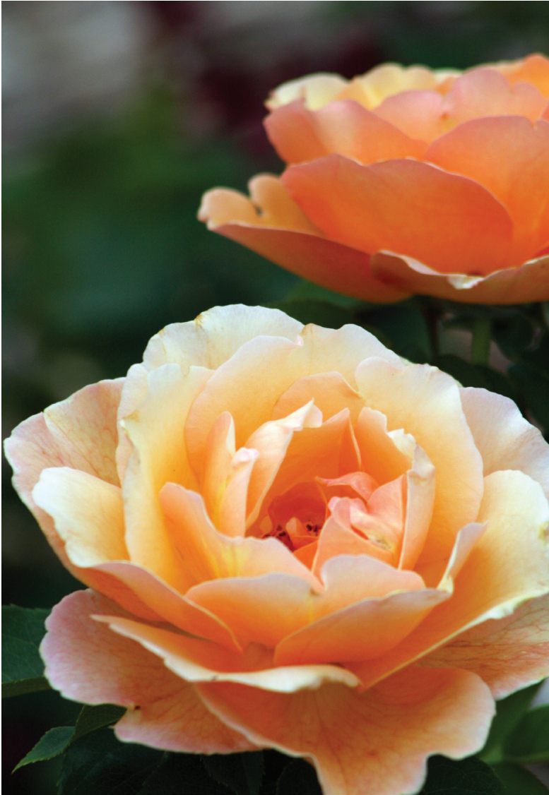
A peach hybrid rose grows in the Missouri Botanical Garden.